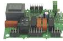
XW 270 K