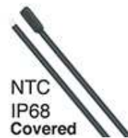
NTC IP68 Covered