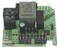
XW 220 K