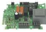
XW 260 K